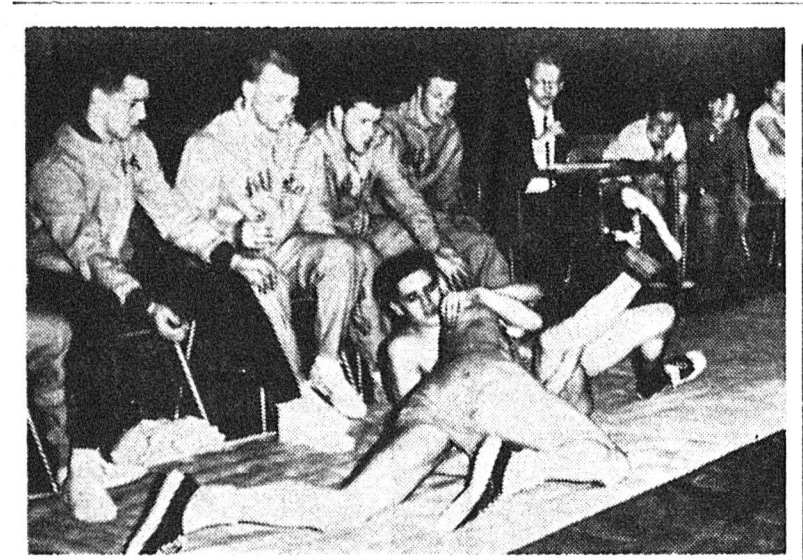
WAY DOWN LOW