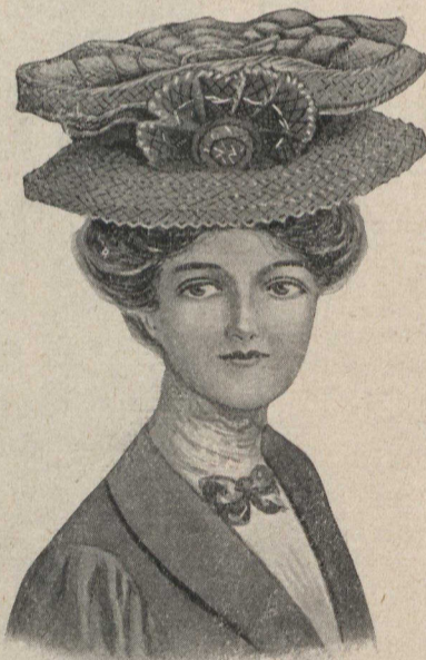
CHI-1000. To start the season with a rush, we offer one of our new Japanese Straw Ready-to-wears, as shown in cut. It has drooping brim with full tam crown, gathered on top in centre with a straw cabachon. Crown is caught up in front with pretty straw rosette. May be had in colors champagne, moss, rose, brown, saxe, and navy. Orders filled while this special purchase lasts. Order early. Special Price ..... 79c.