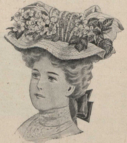
CHI-698. MISSES' HAT , of Bedford chip braid; wired bows across front of Japanese silk, which is also shirred on wires in middle, geraniums and foliage at each side, velvet bandeau. Colors black, white, navy, brown, tan, champagne, pearl or delf blue, with colored flowers to harmonize 1.95