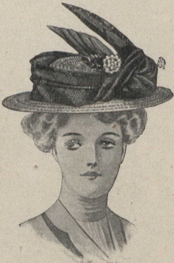
CHI-703. BROAD SAILOR of fine straw braid, trimmed around crown with pyroxyline braid over chiffon, braid also arranged tastily in front with pair of wings and two stick pins, small velvet bandeau. Black, white, navy, brown, saxe blue with black or white wings..... 2.75

☞ Have your order for WOMEN'S TRIMMED AND UNTRIMMED HATS sent by express when possible, as it is much safer than to have them go by mail. Prompt delivery and satisfaction guaranteed.