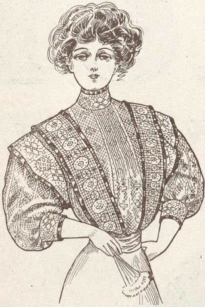
C162—Elaborate Waist of ecru fillet net, all-over Cluny effect; tan silk lining throughout; kimona sleeve, cuffs; front and back trimmed with wide Cluny insertion and piped with brown, navy, sky, black or tan silk. Sizes 32 to 42. Special $4.25