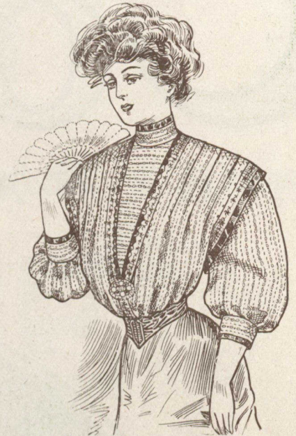
C164—Handsome Waist of fine ecru all-over Valenciennes or fancy net; tan silk lining throughout; dainty vest effect and wide tucks back and front; new Mikado sleeve, cuffs and front trimmed with heavy guipure insertion and piped with silk in shades of black, navy, tan, sky or brown. Sizes 32 to 42. - - - - - $5.00