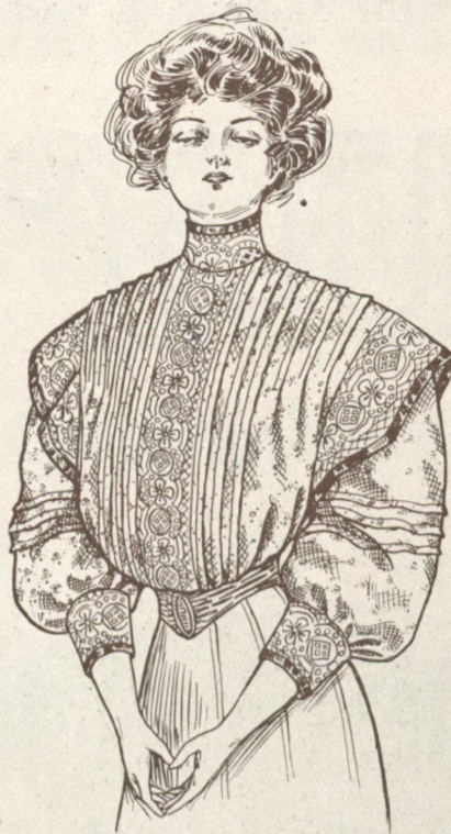
C163—Pretty Waist of fine quality fancy ecru net; tan silk lining throughout; cut very full and made front and back with clusters of wide tucks; new Mikado sleeve, front and cuffs elaborately trimmed with wide Cluny insertion and edged with lace; same style only made in large mesh ecru fillet net, piped with navy, brown, tan, black or sky silk. Sizes 32 to 42. Special value $3.50