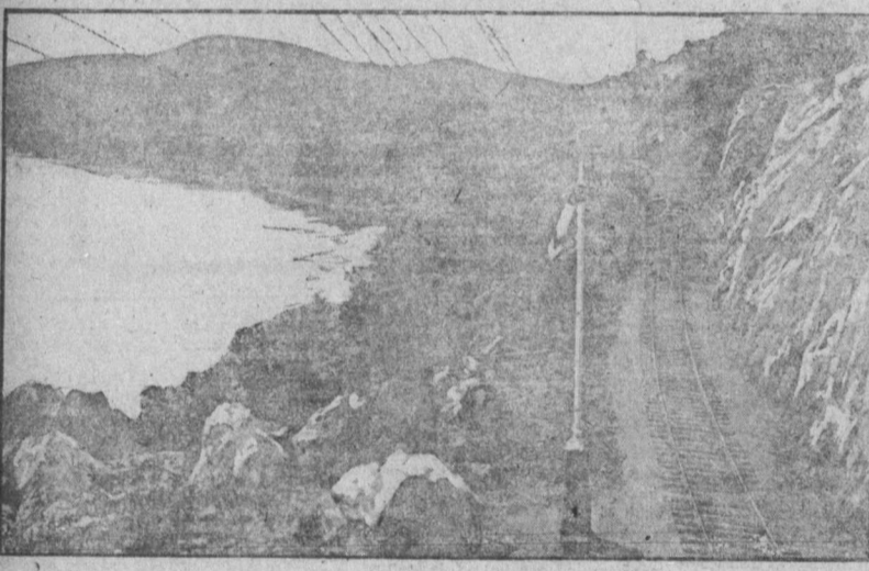
D. & H. Line.—Cliffs on shore of Lake Champlain.

THE great industrial wealth and the wonderful historic interest of the country served by the Delaware & Hudson Company give especial interest to the linking up of this company with the Canadian Pacific Railway. It is the country of anthracite coal, and it is the country of Fenimore Cooper, whose tales of the French and Indian wars are known to every schoolboy. In spite of Mark Twain's joke that the Indians of Fenimore Cooper were an ancient tribe that never existed, the country round Glen Falls, Lake George, Otsego Lake, and Fort William Henry is dotted with localities identified with the Last of the Mohicans, and Leather Stocking. The hunting and fishing grounds of the Five Nations and the Algonquians are now famous hunting and fishing grounds for tourists, who find in this rugged lake and mountain scenery of the Adirondacks the scene of many a happy holiday. Coal is the industrial background of the D. & H. and the demand for coal in Canada today makes the value of the connection between this railway and the C. P. R. all the more apparent. It was to carry coal that the canal from Rondout on the Hudson to Honesdale, Pennsylvania, and the connecting