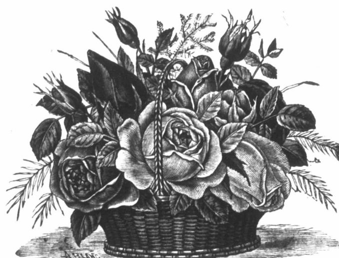
PRETTY FLORAL OFFERINGS.