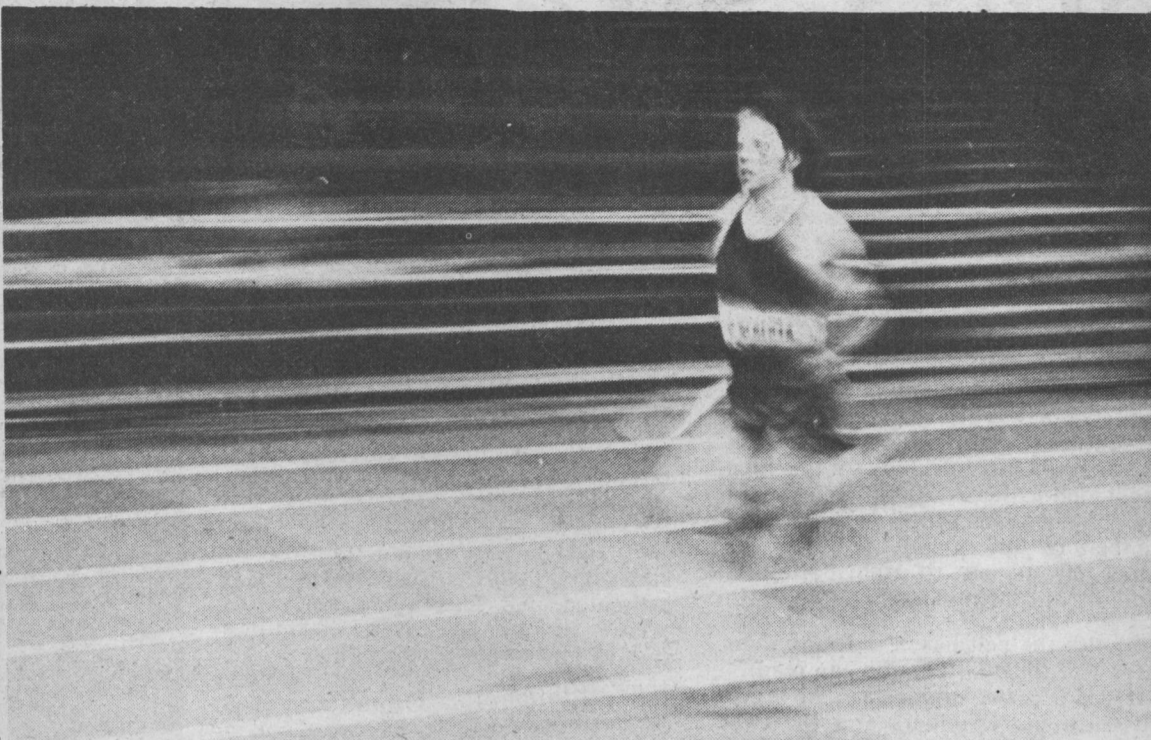
U of A's strengths are the sprint and relay events.