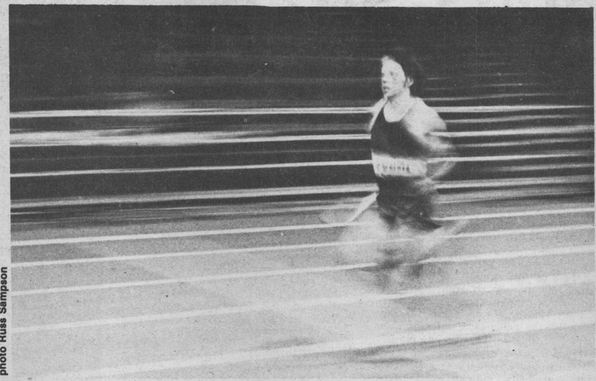
U of A's strengths are the sprint and relay events.