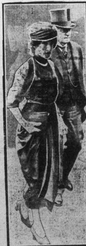
LATEST PICTURE OF MR. AND MRS. ASQUITH.

The Waterloo County Loan and Savings Co.