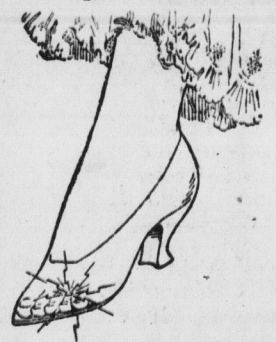
corn, instantly that corn stops hurting, then you lift it right out. It doesn't

corns lift right off with fingers. No pain!