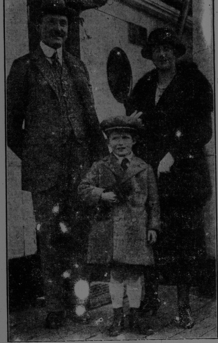
Photo shows Governor-General of South Africa, the Princess and Earl of MacDuff and their son, just before sailing from Southampton.