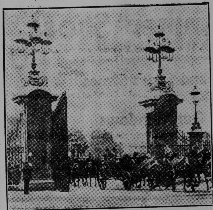
From a photograph taken when the Royal Carriage with the King, the Prince of Wales, the Duke of York and King Albert of Belgium was passing through the beautiful entrance gate of B uckingham Palace, London.