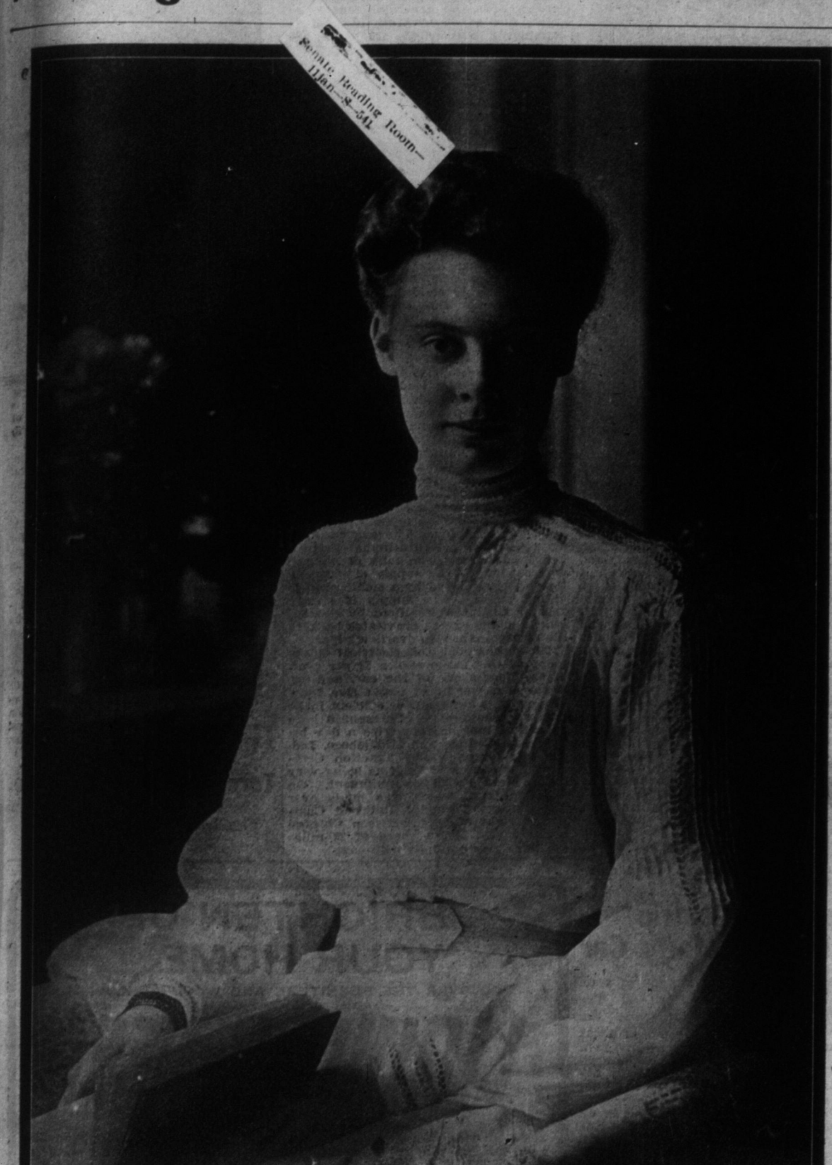
THIS WEEK'S IMPERIAL WEDDING-THE BRIDE, CECILIE, DUCHESS OF MECKLENBERG-SCHWERIN.

But even the she would not be par- ordeal of stiff and unyleiding ceremony the members of the two families and