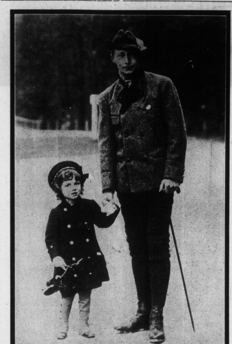
THIS WEEK'S IMPERIAL WEDDING-THE BRIDEGROOM, CROWN PRINCE FREDERICK WILLIAM OF GERMANY, AND THE

parting guest with torches. Frequently, courtesies to kaiser, kaiserin crown breasts covered with decorations and the torches were borne by professional prince and crown princess, in the order gold lace showing abundantly, their dancers; hence, the origin of the torch named. The bowing over, the band hands still grasping the tapers, march dance, which long since was incorporatstrikes up a piece of music especially in dignified procession before her.