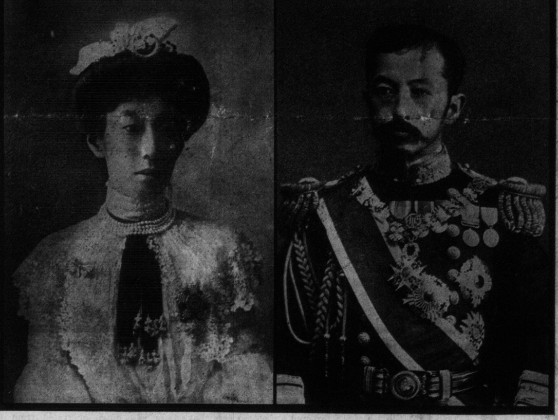
PRINCE AND PRINCESS TARUHITO ARISUGAWA, REPRESENTATIVES OF THE EMPEROR OF JAPAN AT THE WEDDING OF THE GERMAN CROWN PRINCE THIS WEEK,

the Nelson of Japan. The is no evidence of luxury of any description, the annihilation of Russia's fleet with the comparatively insignification and aristocratic part of the city. up than that of the American sailor mestic arrangement is conducted on a upon which he had been enabled, before cycle or rickshaw being kept on the tion. Togo had a much different and taker during the admiral's absence much more formidable proposition to The only evidence of distinction to be