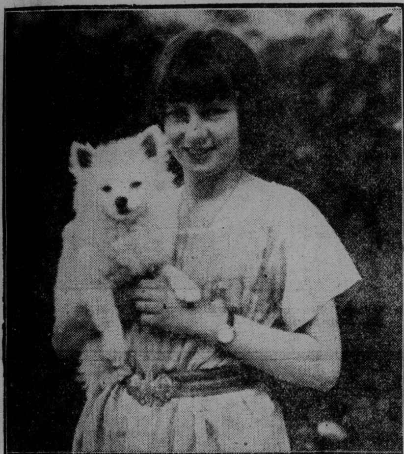
Princess Eliana, daughter of the Queen of Rumania, and her little white dog. The photograph was taken during a celebration in Campeni, Transylvania.