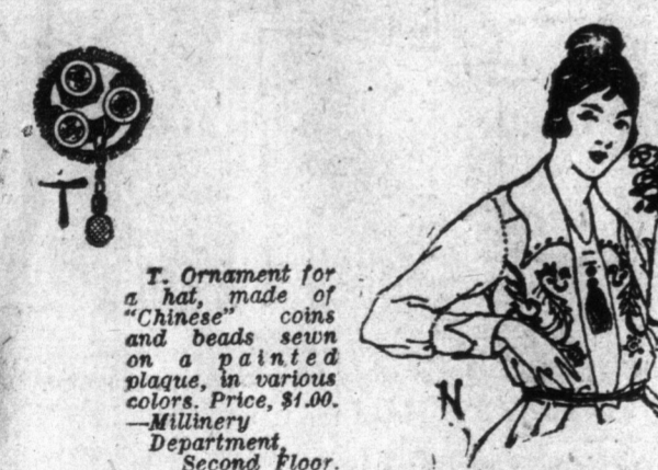
T. Ornament for a hat, made of "Chinese" coins and beads worked on a painted plaque, in various colors. Price, $1.00. -Millinery Department, Second Floor.