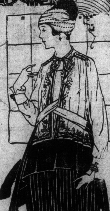
G. Look at the lady opposite and you'll see whence is drawn the inspiration for this picturesque costume--a clever combination of putty-colored and navy crepe de Chine. The smock-like top goes on separately, its fullness held in position by the crossed sash, and the embroidery--very Chinese--is carried out in navy and Chinese blue, the last shade matched by the pretty ribbon at neck and wrists. The straight skirt is finely pleated. Price, $125.00. -Women's Dress Department, Third Floor.