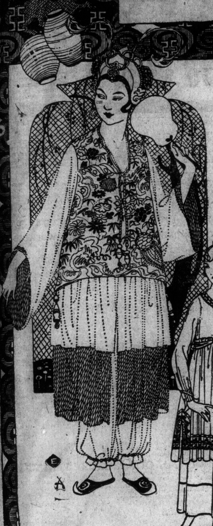
A. Very Chinese the costume above, which you may wear for fancy dress or as a vest gown, just as your fancy dictates. The coat is like that worn by some of the best Chinese ladies, made of grey crepe silk, all gorgeous with wonderful embroideries, on which gold and vermilion make a perfect blaze. It is lined, too, with vermilion silk. The rest of the costume, which is slipped on over the shoulders, is made of smoke grey crepe chiffon, over vermilion, which shines through with most delightful effect. Price, $100.00. -Wigmore Department, Third Floor.

Appearing in Almost Every Phase of Feminine Attire, in Hats, Coats, Suits, Dresses, Blouses and Sports Garb, Specially Evident in the Modish Details of the Toilette Such as Tasselled Trimmings, Embroideries, Parasols, and Most Insistent in the Chinese Colors--Yellow, Blue, Red, Jade, Green, With Pale Pink and Grey to Supply Restful Backgrounds.