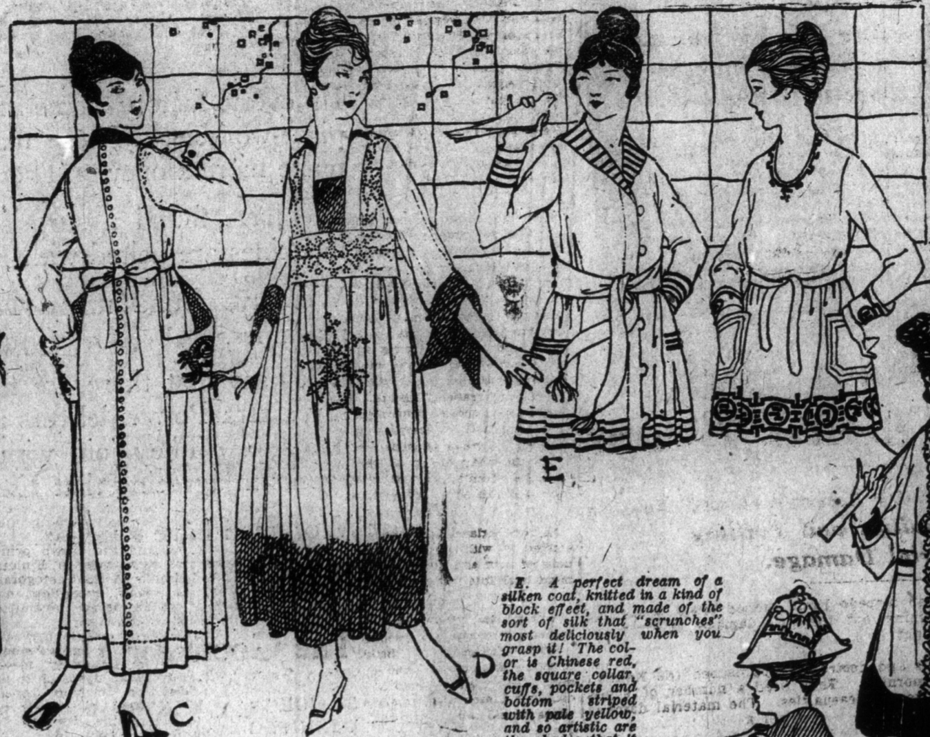
C. The tabbed phoenix--in China emblem of benevolence and good tidings, has alighted in a decorative burst of color on the pouch-like pockets, formed by the upturned jumper of the delightfully simple frock of oyster white shantung. But despite the Chinese nature of the front, the back is distinctly French, with its pair of close buttons from neck to hem, its queer little sash and the group of pleats at the sides. The fringed plects at the sides and wrists held by straps and embroidered buttons, the drawn-work at the hip and the make of the surprisingly dainty frock. Price, $80.00.