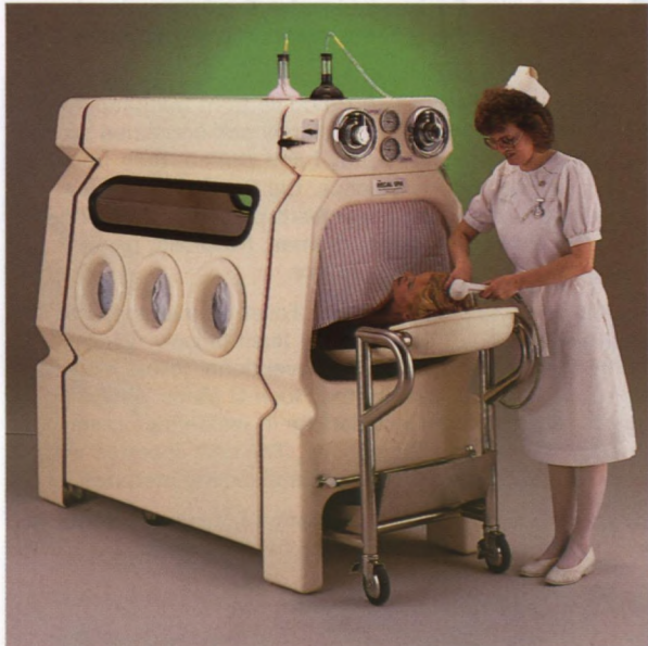
The Regal Medi-Spa shower simplifies the care and bathing of burn patients and others who are difficult to move without causing pain.

Sanitation Equipment Limited 35 Clon Court Concord, Ontario Canada L4K 3S7 Tel: (416) 738-0088 Fax: (416) 738-2483