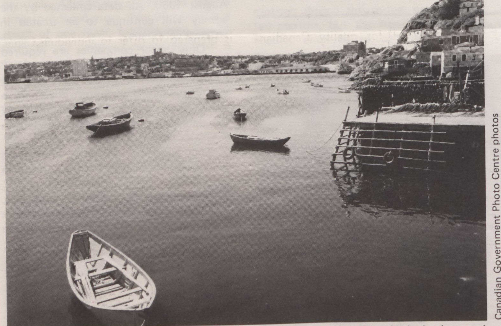
A partial view of the port of St. John's, Newfoundland with the village in the background.

The task force has one more piece of work to complete before disbanding. It is representing the federal government in negotiations on the financial restructuring of certain financially troubled trawler companies based in Nova Scotia and Newfoundland. The other parties involved in those negotiations are the companies themselves, financial institutions and provincial governments.