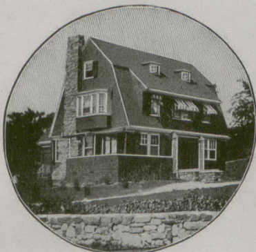
Clark & Russell, Architects, Boston, Mass.

The Original and Standard Shingle-stains. Used and proved in every climate for over twenty years. Every gallon guaranteed.