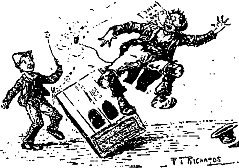
ON A HELPLESS CRIPPLE.