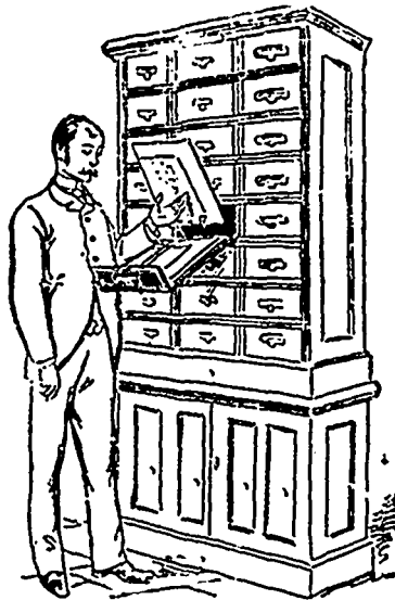
Shannon Filing Cabinet on base, showing how papers may be examined without removing drawer.