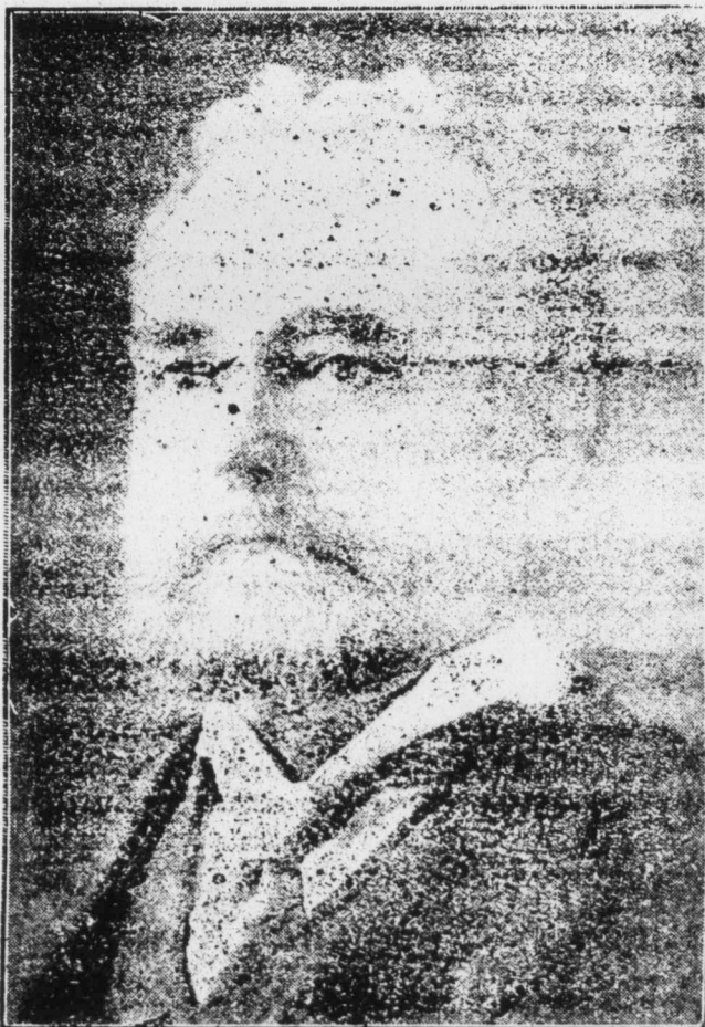
HON. DR. WILLIAM PUGSLEY, MINISTER OF PUBLIC WORKS.

St. John, Sept. 29th. Liberals then spoke on the needs, the progress throughout the province and in the West Indies, and possibilities of Canada and New Brunswick generally and of St. John particularly. He assured the people that he would continue to work in the interest of the province.