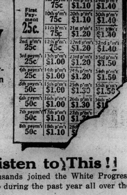
Table of Payments

Only a few machines are left. You must Hurry if you want a White on this Plan. WE DELIVER A WHITE TO YOUR HOME UPON PAYMENT of 25c. The balance of the payments are so easy you never miss the money.