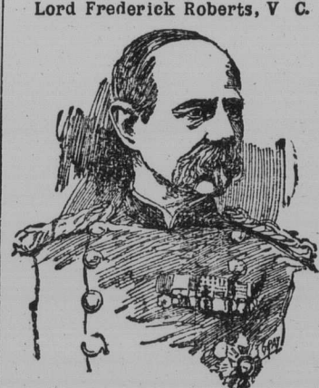
COMMANDER-IN-CHIEF OF THE BRITISH ARMY IN INDIA RECENTLY RAISED BY THE QUEEN TO THE RANK OF FIELD MARSHAL.