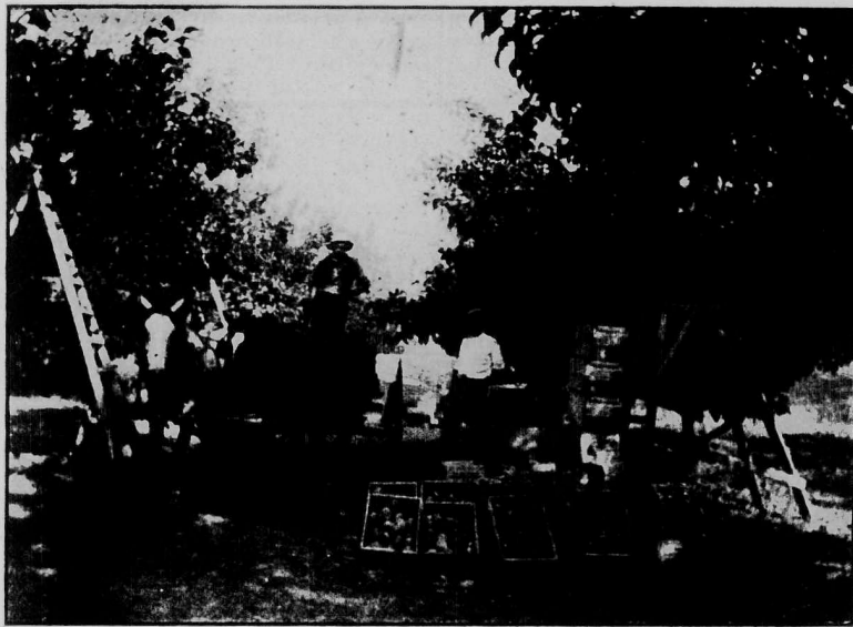
APPLE-PICKING SCENE IN BRITISH COLUMBIA.

for exhibition in August. He is at present at pasture, having been turned out June 1st. I purpose taking him up in July and commence feeding, but like to know what to feed to obtain just the right degree of flesh for showing. Show condition, I consider, is not a mass of soft fat sometimes seen on cattle at provincial fairs.