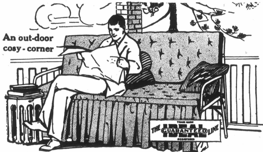
An out-door cosy-corner

See this strong, sensible, serviceable all-steel davenport and you'll want to get one for your porch or summer home.