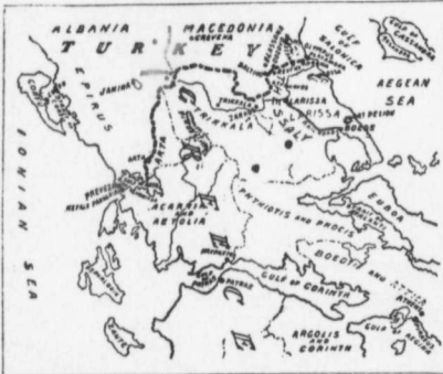
MAP SHOWING TURKO-GRECIAN FRONTIER OPERATIONS

settlement of the Cretan question. No one, not even the Sultan himself, expects Greece to accept these terms. The powers will doubtless have considerable to say in the fixing of the indemnity. Space prevents us speaking further of the events of the war. The map which we publish will give our readers some help in understanding the movements of the contending armies.