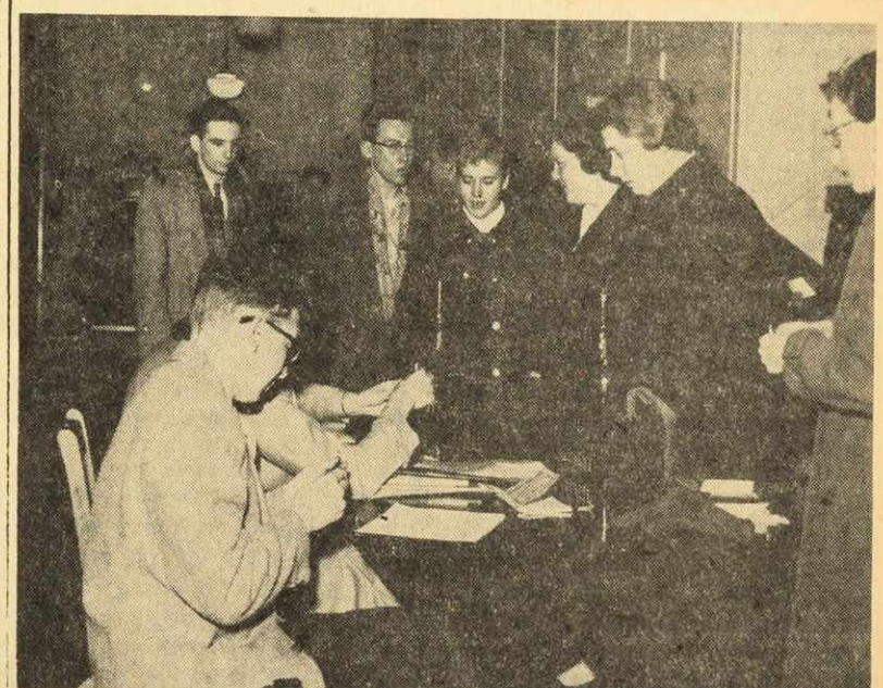
DALHOUSIE STUDENTS went to the pools last week and returned a Conservative government with a complete majority. There was a good turnout of voters, witness the crowd above. Anyone for Social Credit?

A complete review of the play may be found on page four.