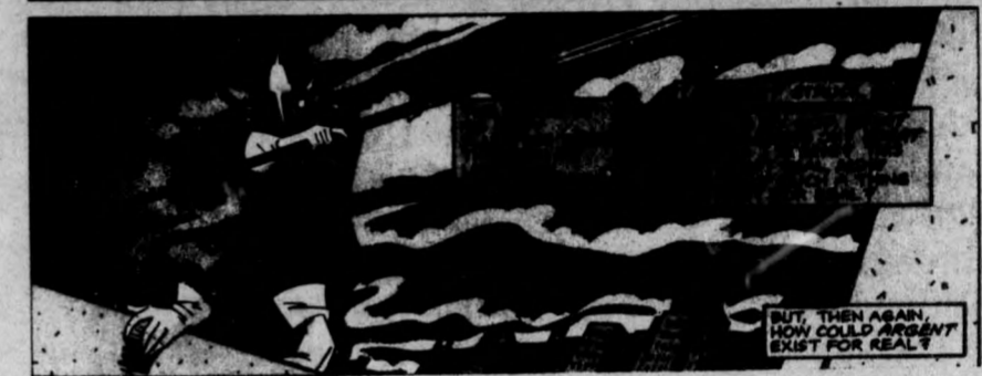
Super-tough Babe Grendel on the trail of vampire scum in the big city.