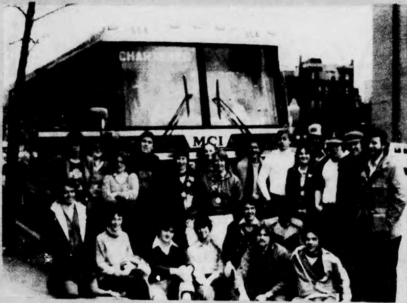
Some of the tired travellers before the long drive back home.