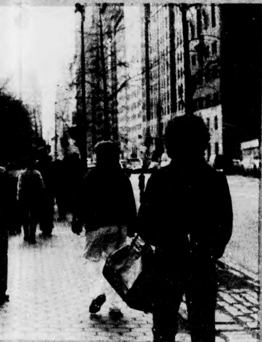
eside Central Park.