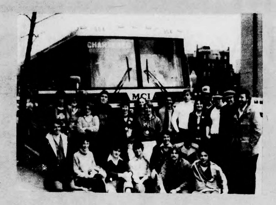
Some of the tired travellers before the long drive back home.