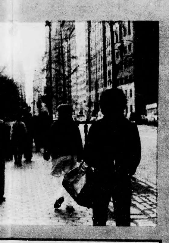
eside Central Park.