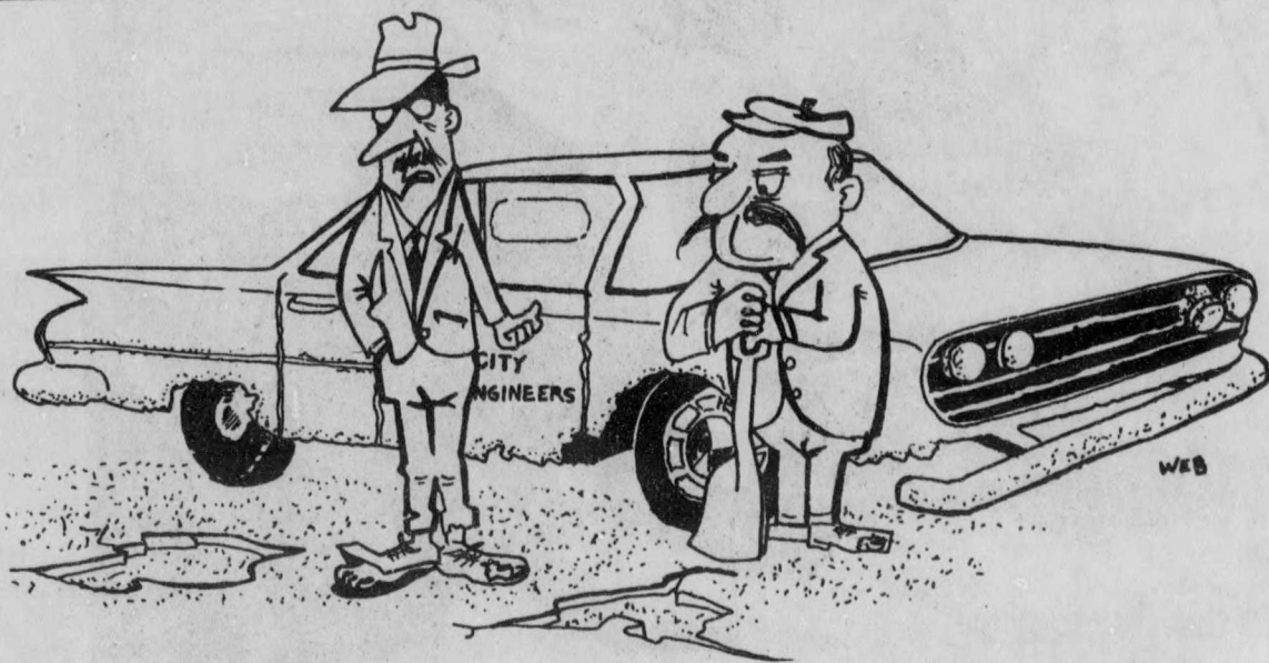
"MAYBE WE COULD USE A LITTLE MORE SALT"