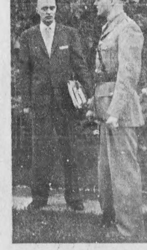
Selected high school graduates, not wishing to undergo academic training for a degree, may qualify as a short service officer after a brief intensive period of military training and later may apply to become a regular officer.