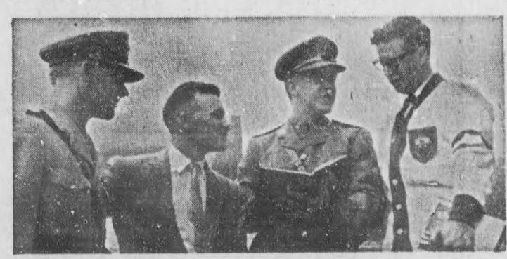
THE CANADIAN OFFICERS' TRAINING CORPS-University undergraduates may obtain a con by training during their spare time and summer holidays. The student who trains under this plants paid for his actual training time and is not obligated for full-time service after graduation.