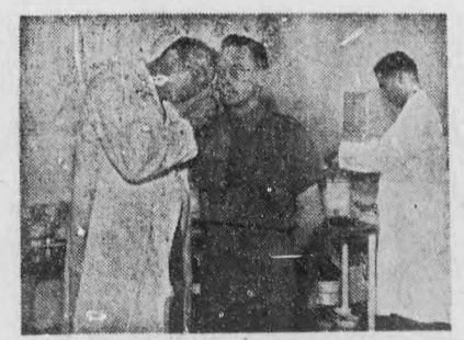
SUBSIDIZATION FOR PROFESSIONAL TRAINING - There are tri-Service plans wherein university students medicine or dentistry can be subsidized during the missioned Doctors or Dentists in the Canadian Armed Forces.

Here are four interesting and rewarding plans for young men interested in a career as a commissioned officer in the Canadian Army: