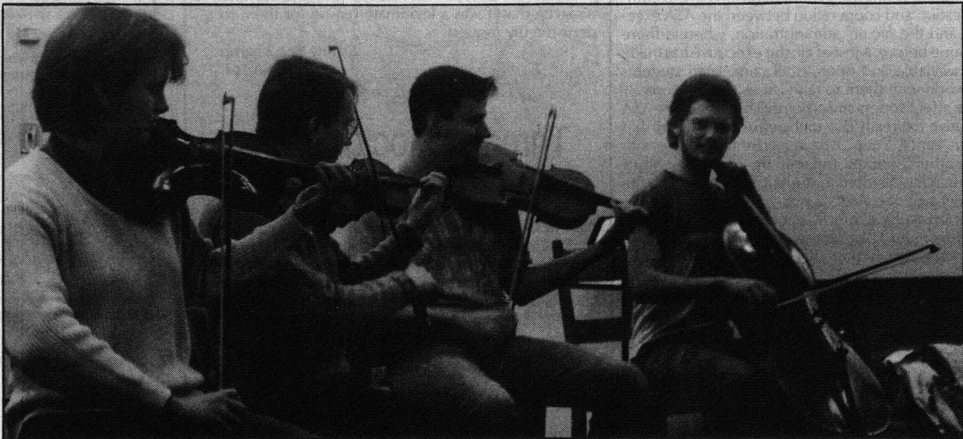
The Seranata String Quartet; "It's not like we ply ourselves with Beethoven 29 hours a day."

The economic recession has not been kind to the arts. In a time when cutbacks are as numerous as tourists to West Edmonton Mall, performing artists were among the first