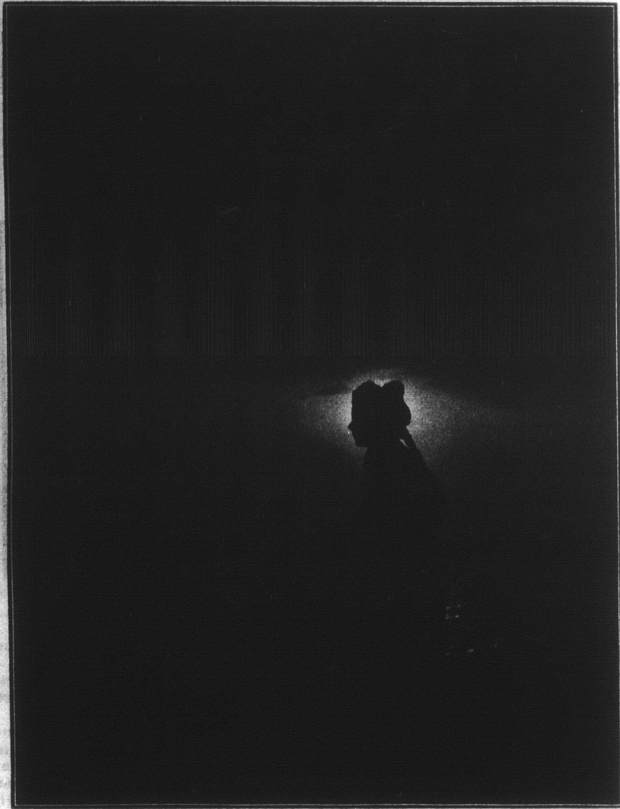
LOOKING FOR THE BOAT'S RETURN.

Among the mountaineers of Albania and Montenegro drunkenness is re-