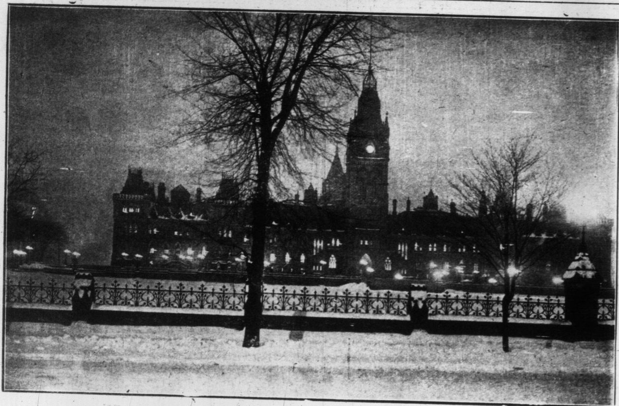
PARLIAMENT BUILDINGS, OTTAWA, ILLUMINATED DURING SESSION

THE WORLD-FAMOUS COMEDY THAT WILL LEAVE LASTING AND SWEET REMEMBRANCES OF GENUINE FUN AND MERRIMENT NEXT WEEK - A DRAMATIZATION OF THE NOVEL OF THE CENTURY "THE COMMON LAW" ROBERT W. CHAMBERS' FASCINATING STORY - NEXT WEEK