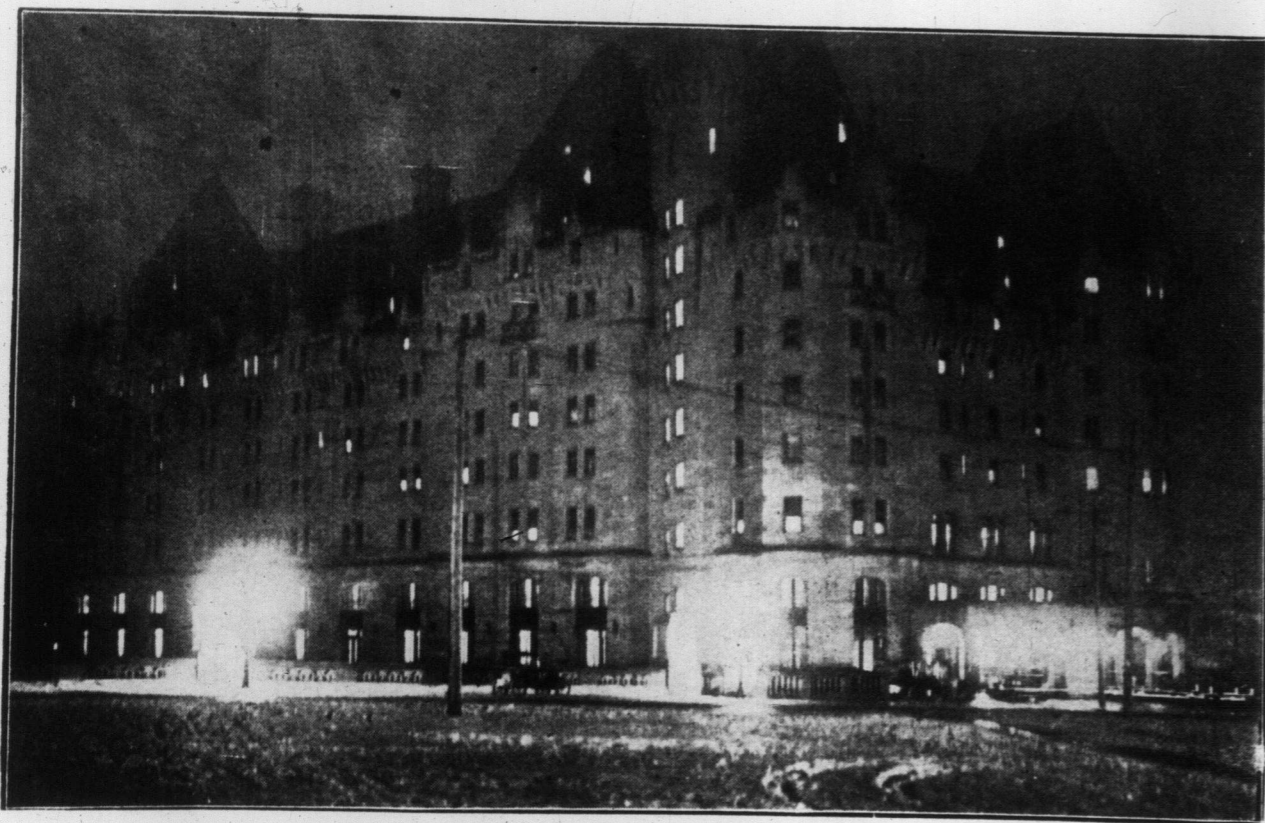
CHATEAU LAURIER, OTTAWA, BY NIGHT, FROM MINERS' AND SAPPGE.