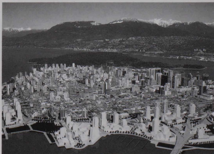
The Vancouver Information Centre has been set up to provide information on one of Hong Kong's most popular Canadian cities. Shown here is the proposed development by Cheung Kong (Holdings) Limited.