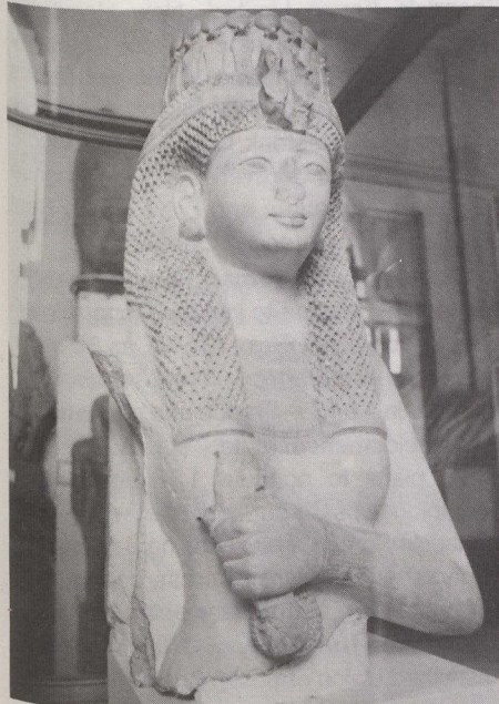
Queen with a menat, carved in limestone 75 centimetres high, is considered one of the statuary masterpieces of the Ramsessides era.

The exhibition, Ramses II and His Time , will be presented in Montreal from June 1 to September 29, 1985. It will then travel to one United States city prior to ending its North American tour at EXPO 86 in Vancouver from May 2 to October 13.