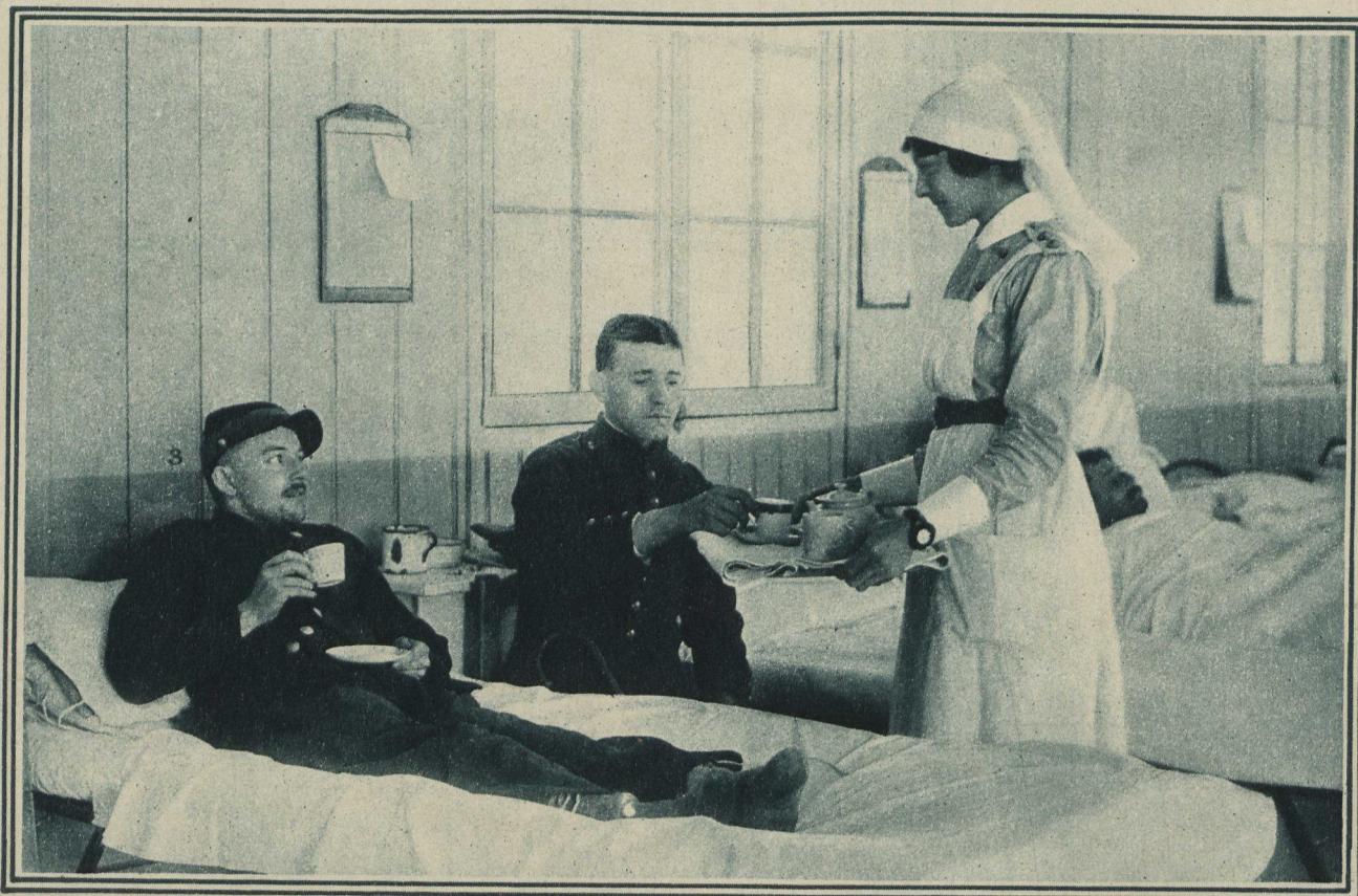
Afternoon tea in the same hospital. The staff is entirely composed of Canadians, but only French patients are admitted.