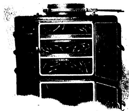
Note the large self-cleaning flue surfaces

stands to-day as the only Hot Water Heating Boiler that has coal-carrying capacity sufficient to maintain, under proper combustion, the maximum temperature for eight hours on one firing.