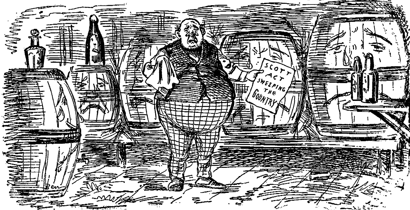
"I'LL HAVE TO WORK FOR MY LIVING LIKE OTHER PEOPLE IF THIS GOES ON."