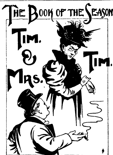
A CLEVER SATIRICAL SKETCH