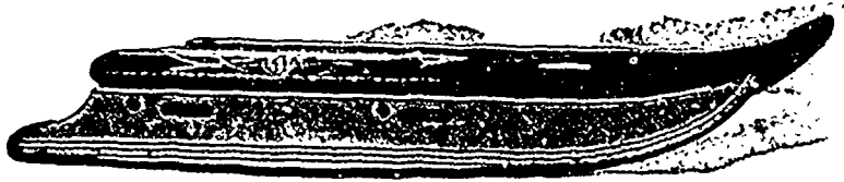
The H. A. Nelson & Sons Co., Limited.

Can anything attract attention more than a talking machine, that talks intelligibly and intelligently, sings, plays orchestral or band renditions, vocal and instrumental solos, duets or quartettes, that can make a stump speech, dance a clickety clack clog dance so realistically that passers-by turn to see the performer, and wonder at his invisibility. Placed in a doorway, with a small boy to attend it and change the sound discs or records occasionally, it is the greatest customer-drawer that can be found. The