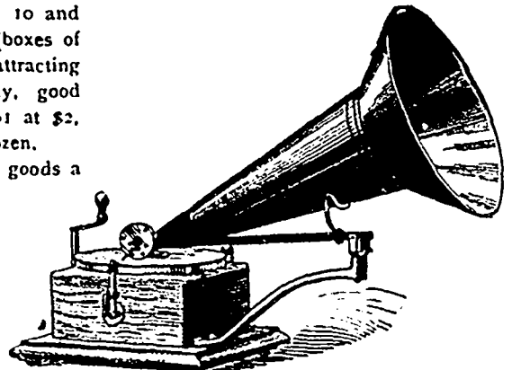
The H. A. Nelson & Sons Co., Limited.

solid ebony that it defies detection, unless cut into. This composition will withstand heat, cold, and dampness, and, in addition to their own individual beauty, the manner of casing in fine paper-covered, sateen-lined boxes would almost alone make their sale assured. Military brushes, one pair in set,