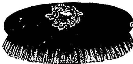
The H. A. Nelson & Sons Co., Limited.

novel line of ebonyed goods, mounted with sterling silver plates, on which initials or monograms may be engraved, is shown. Our illustration shows a good representation of one of the brushes used in these sets. The material used is not ebony, but a composition, of such good imitation of