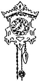
Carved Clock, 95c. each.

A neat line of miniature carved clocks at a very minimum price is a revelation. Think of it! A clock with carved case, made in several designs, that keeps time, and that will run 24 hours simply by pulling the weight chains, with brass works and chain, costing only 95c. each. Every storekeeper wants an attraction at the Christmas season.