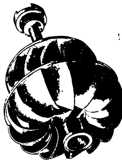
Cut Showing Wheel Removed from Case

Made in sizes from 6 inches to 84 inches diameter. Wheel One Solid Casting. 84 per cent of power guaranteed In Five Pieces. Includes whole of case, either register or cylinder gate.