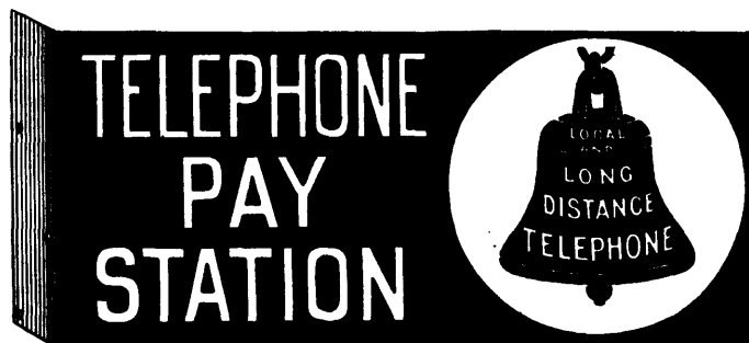
No. 5. Double, 19½ x 8 inches, including flange. If made single, without flange, 18 x 8 inches.