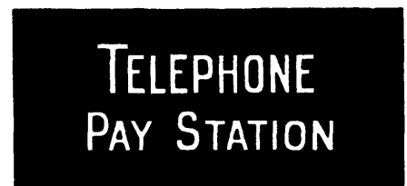
No. 8. Single, 18 x 8 inches.

These signs can be made in any colors. Blue and white are the most effective and are generally preferred.