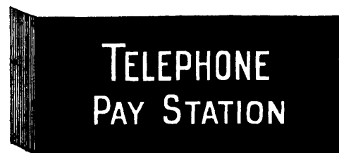
No. 6. Double, 19½ x 8 inches, including flange.