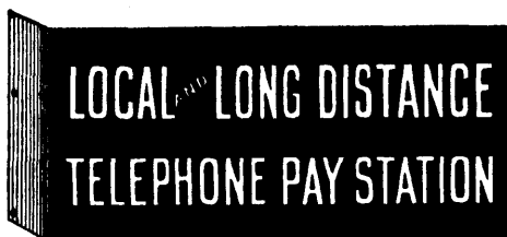
No. 7. Double, 19½ x 8 inches, including flange. If made single, without flange, 18 x 8 inches.