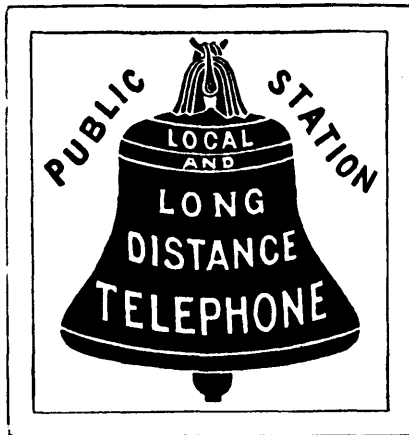
No. 1. Single, 17 x 18 inches. If made double with flange 18½ x 18 inches.

Guaranteed Not to Fade or in any way to Perish from Exposure.