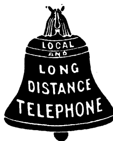
No. 3. Single, 6½ x 7½ inches.