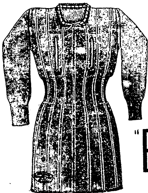
"Elyslan" Nursing Vest.

Made from finest European Yarns. Wholesale trade only supplied.