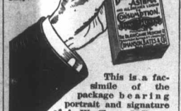
This is a facsimile of the package bearing a portrait and signature of A. W. Chase, M.D.

But Imitations Only Disappoint. There are many imitations of this great treatment for coughs, colds, croup, bronchitis and whooping cough. They usually have some sale on the merits of the original, but it should be remembered that they are like it in name only.