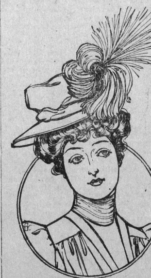
BLACK STRAW HAT.

Linen collars to be worn with shirt waists have a frilled border or hem