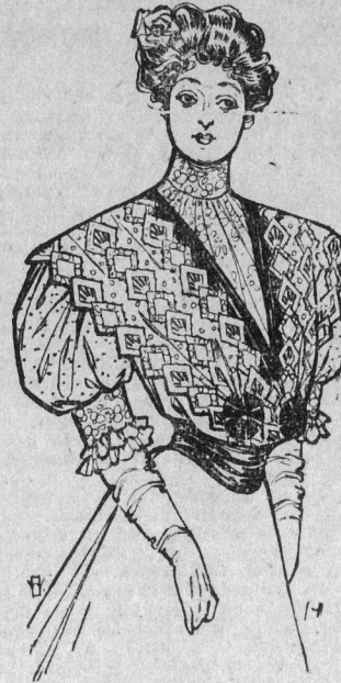
WAIST FOR MATRONLY WOMAN.

Automobile veils are generally put on from the brim of the hat downward,