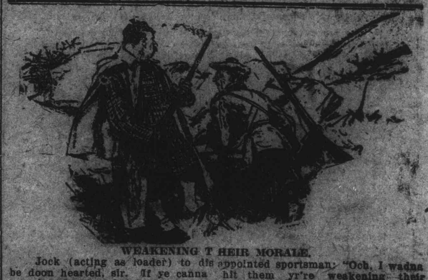
WEAKENING THEIR MORALE. Jock (acting as leader) to his appointed spokesman: "Och, I wadna be doon hearted, sir. If ye canna all them y'r' weakening their morale.—London Opinion.

Berne, Monday, Nov. 25.—(By the Associated Press)—Madame Rosita Schwimer, of Ford peace party fame, who has accepted the post of Hungarian ambassador to Switzerland, being the first woman to receive such an appointment, declared to the correspondent to-day that the food needs of Hungary were "nowhere near urgent."