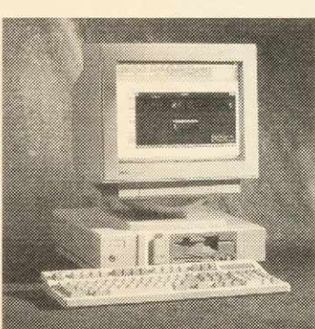
NetPlex™ 433/NP $2,299*