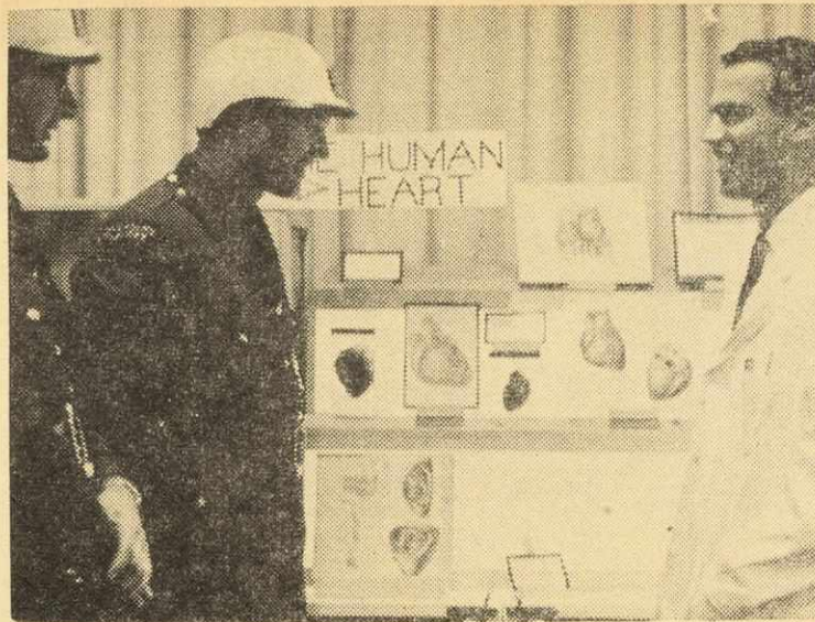
HAVE A HEART — Meds student invites heartless lawmen to step in for a closer look at the Medical School Open House last weekend. Successful Meet Medicine programme was the first of its kind presented at Dalhousie.

The new ski club held its second meeting Sunday. Elected to