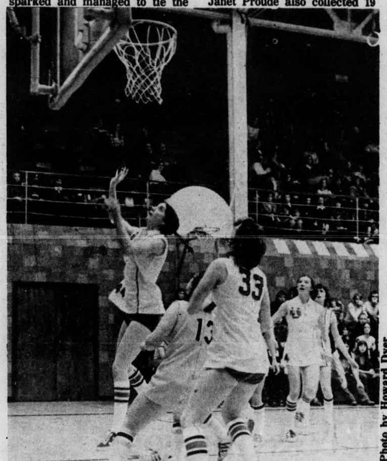
NB goes up for another two points in a match held a week ago Saturday. UNB beat the Dalhousie Tigerettes 61 - 58 to advance to the National Tournament. The Red Bloomers lost in the final in the tournament to

The Bloomers would like to thank all their supporters and hope to see many of them back next year when the "Bloomers rise" again.